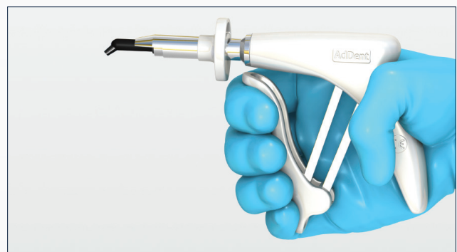
Holding the CoMax to express composite