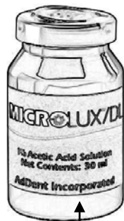
Acetic Acid (Mouth rinse)

MOUTH RINSE: Acetic Acid (30ml), 1% dilute solution